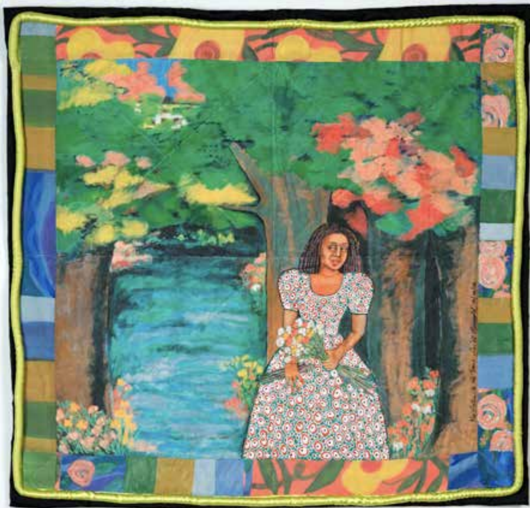
Faith Ringgold Listen to the Trees , 2012 Quilt with digital inkjet, silkscreen, woodcut, and acrylic on Habotai silk