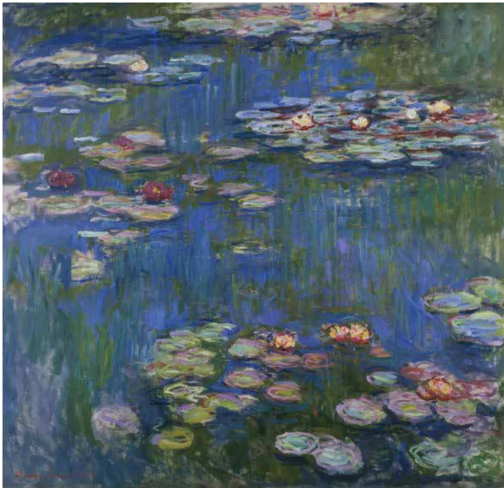
Claude Monet Water Lilies , 1916 Oil on canvas